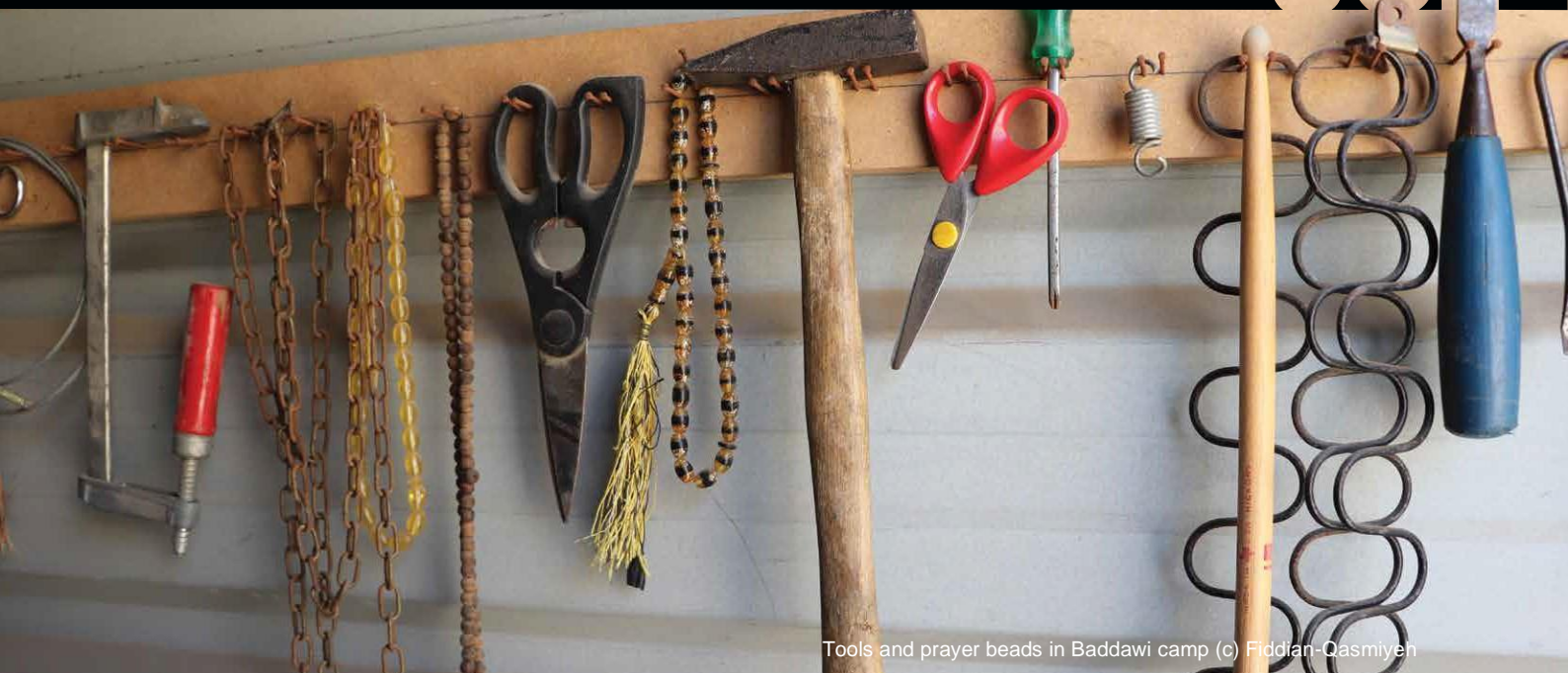
Tools and prayer beads in Baddawi camp