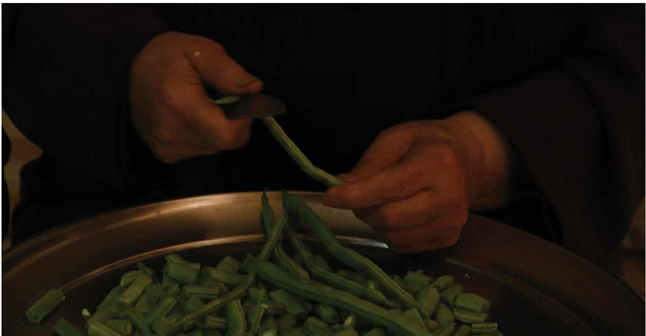
Preparing food in Baddawi camp

Indeed, a key factor emerging in such assumptions is precisely the extent to which Muslimness or religiosity is overexaggerated by external observers and becomes the overarching frame of reference, erasing recognition of not only the potential for, but reality of, solidarity across political lines.