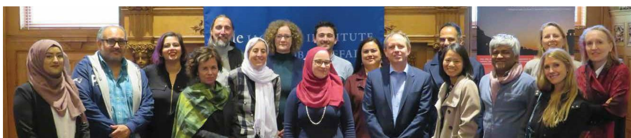
The research team and colleagues at the Bridging Voices Workshop, Yale, May 2019

The research teams experienced several challenges in the course of fieldwork which are important to acknowledge and reflect upon.