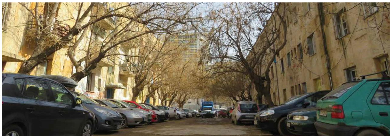
Refugee housing project from 1900s, Athens

It seeks to do so whilst recognizing the extent to which states around the world are increasingly introducing restrictions and political strategies that currently prevent many of these principles from being put into action. These restrictions and strategies range from travel bans and deportation regimes, to journalists and humanitarian workers being killed, to humanitarians and solidarians being criminalised, to the introduction of finance laws and countering violent extremism policies, all of which are having, and will continue to have, wide-ranging effects. 100