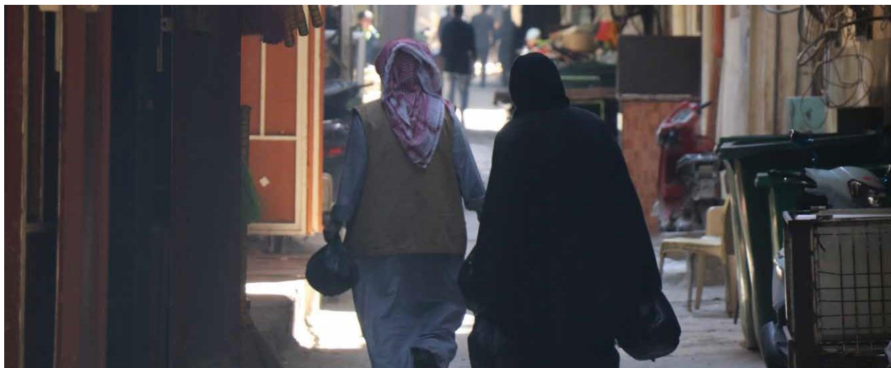
In the streets of Baddawi camp

This final section of the report turns to the complex relationship between religion, social justice and institutionalized responses to refugees through a multiscale framework, from the local to the international.