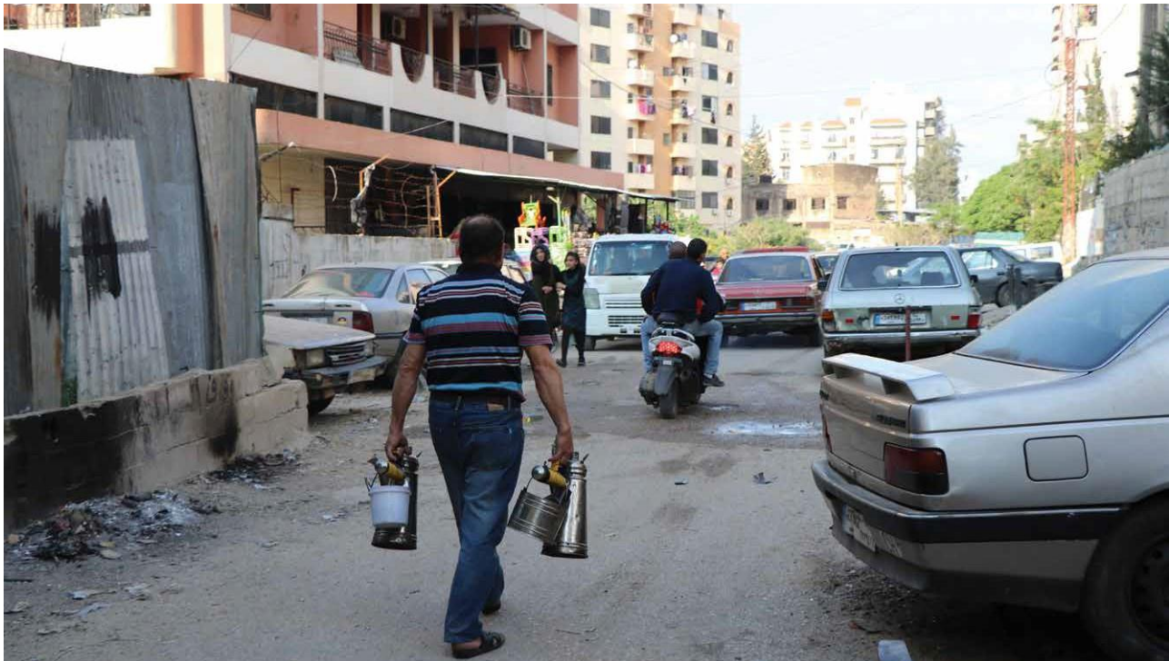
A Syrian coffee vendor on the outskirts of Baddawi camp

the first two sections of the report challenge us to think beyond narratives that interpret faith in contexts of displacement as something to be mistrusted, leading only to negative outcomes, violence or suspicion.