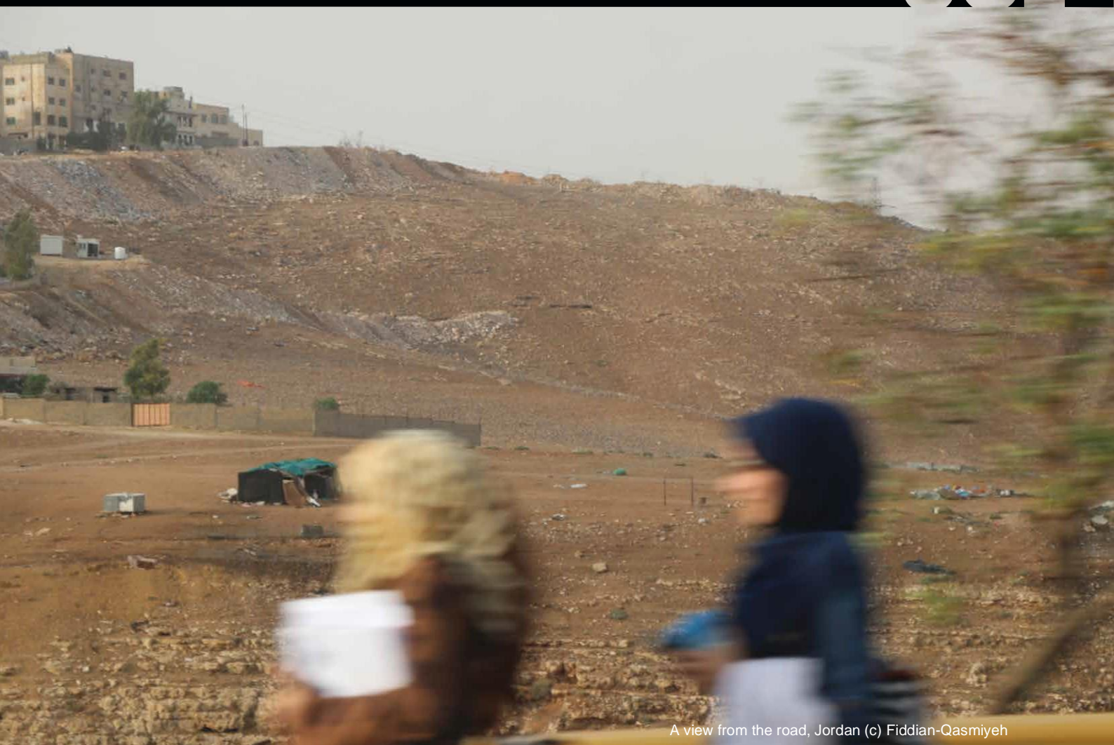
A view from the road, Jordan