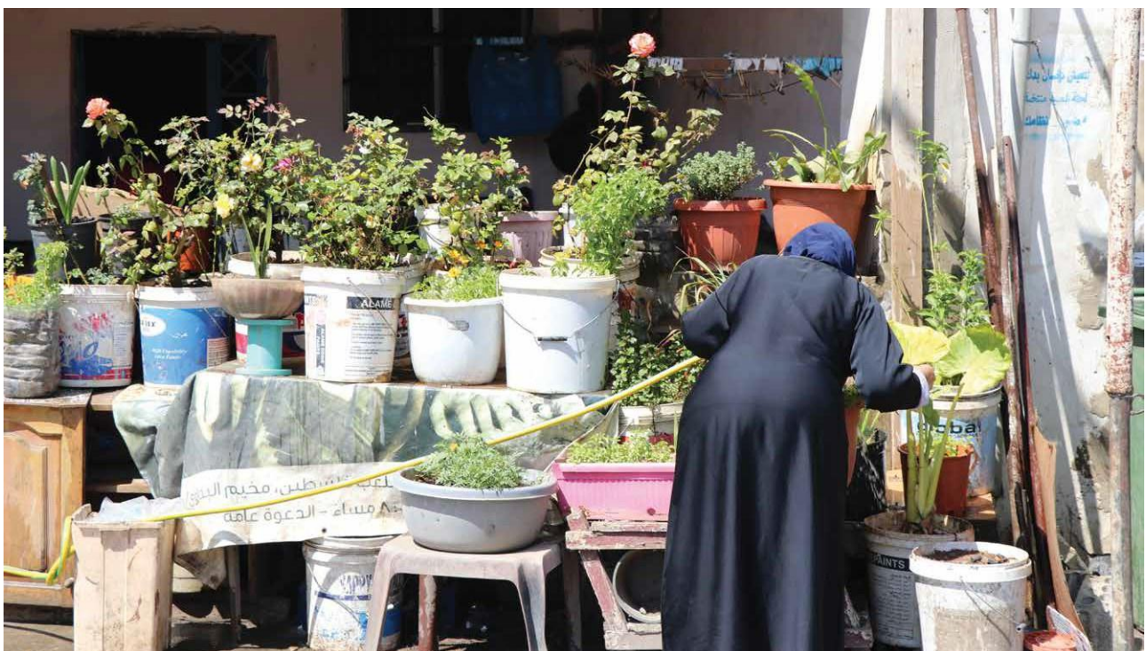
A woman waters flowers in Baddawi refugee camp, North Lebanon

Like many members of host communities and faith-based organisations, refugees themselves act to support members of their own and other communities precisely because states and international organisations are failing and refusing to do so. The invocation of depending on God emerges precisely as a direct critique of the failure of political systems. 102 Far from a fatalistic response to such conditions of manufactured precarity and restrictionism, local and transnational actors alike are creating diverse ways of conceiving