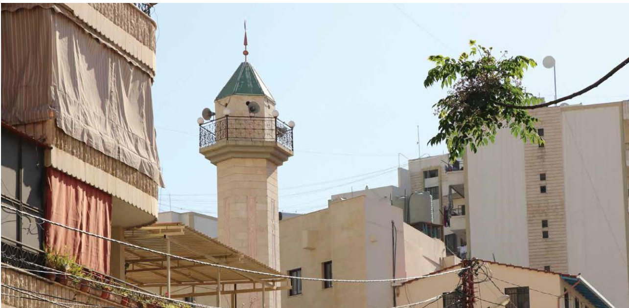
The mosque in Jebel Al-Baddawi, Lebanon

For example, the iconography of both faith-based organizations and US law enforcement groups portray a vivid humanitarian and political emergencies - as migrants cross the border, militaries enforce border security. For FBOs, solidarity lives in images on walls and in shared experiences, such as making and serving food together. For refugees and migrants, it is expressed in a shared history, through the actions of people and what is left behind: a sense of suffering and sacrifice. In contrast, law enforcement agents exhibit a different form of solidarity – one rooted in patriotism, service, and professionalism. 92 We can contrast here a religious, sacred sense of solidarity with a secular, nationalistic language of solidarity, both highlighting the need to stand together and be ready for collective action.