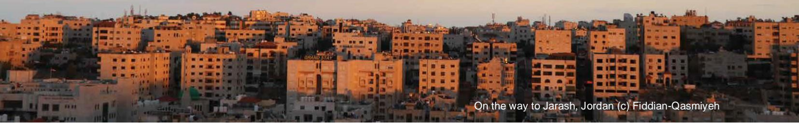
On the way to Jarash, Jordan