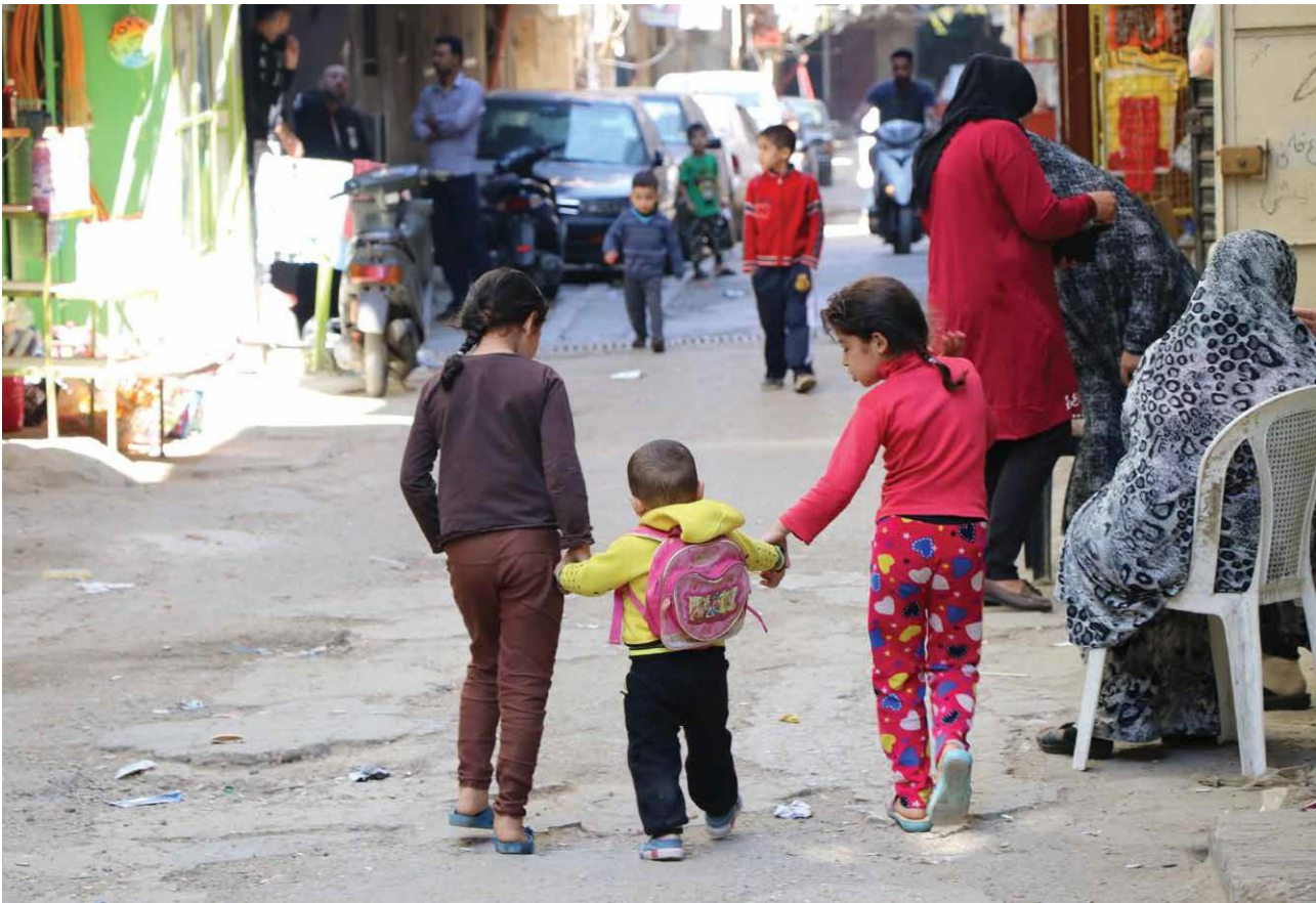
On the way to school, Baddawi refugee camp, Lebanon