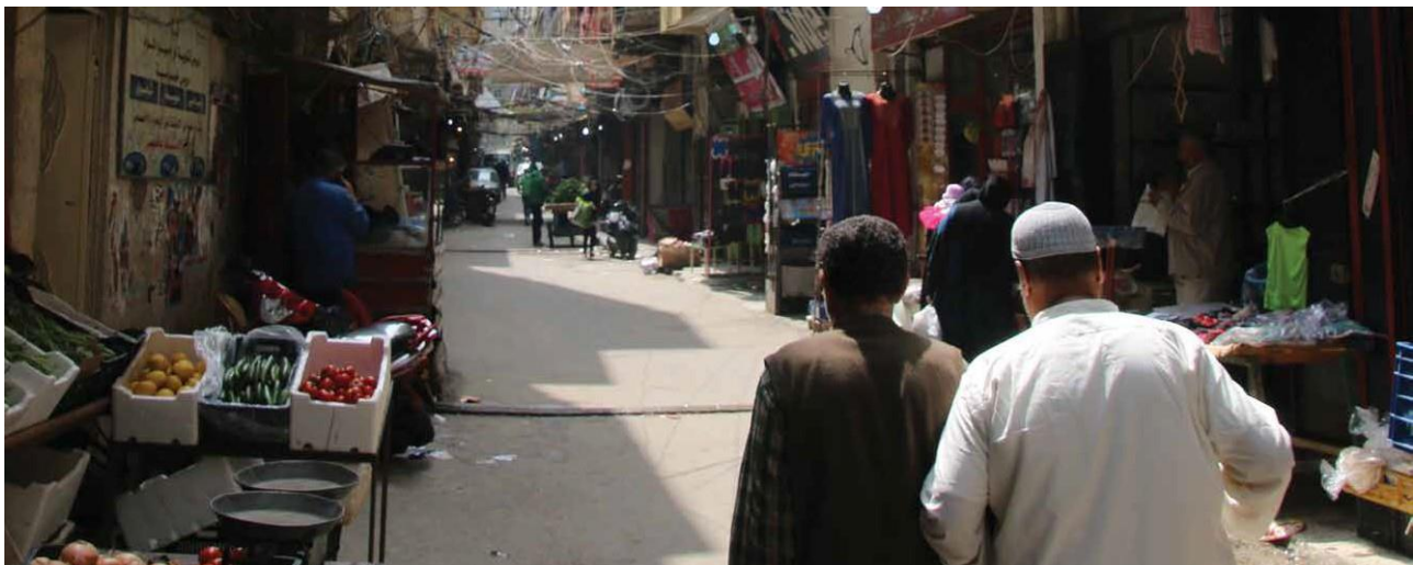
An evening stroll in Baddawi camp, Lebanon

Acknowledging, and appreciating the “significant work” undertaken by refugees and refugee-hosts must take place in conjunction with the acknowledgement of the responsibilities and duties that should be upheld by international actors, including states, UN agencies and INGOs.