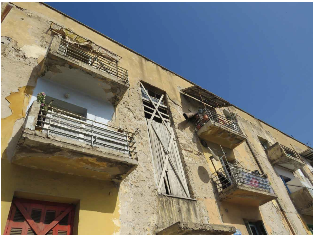
Refugee housing project from the 1920s in Ambelokopi, Athens

In this instance, as in the case of Lebanon explored below, 44 religious rights are conceived of not merely in terms of accommodating the living: the right to be buried as a Muslim is imagined as a refugee right which must be fought for. Refugees in Greece regularly described how their faith and their religious practice was a source of strength as they endured extreme stress. Providers also talked about the ways that religious community and ritual was often a source of support and comfort for refugees. Importantly, as this example, and many others from the research in Lebanon, Cameroon, Jordan and Mexico also indicate, the people who ‘provide for’ refugees 45 are often themselves either refugees or the descendants of earlier generations of migrants or refugees.