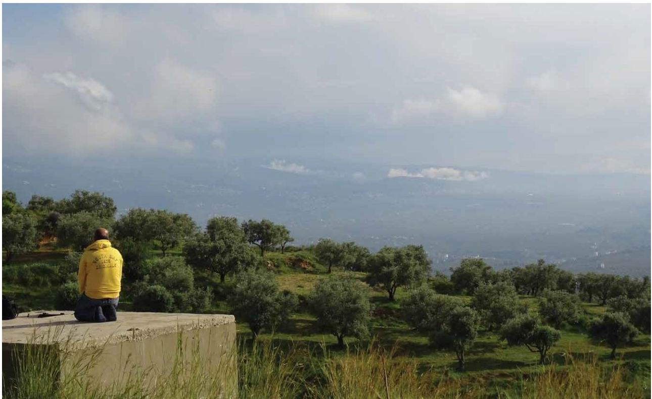
A man prays on the route to Baddawi camp

In conclusion, the multisited framework underpinning our project enabled us to identify the importance of historical and geographical specificities, whilst also highlighting diverse commonalities of experience. These commonalities point to the ways that persecution, violence and diverse forms of social injustice are linked to similar systems and structures of inequality and exploitation. These include states that not only fail to protect refugees and migrants, but also create precarity and risk across time and space. It is against this backdrop that we find non-state actors acting in ways designed to fill the gaps created by states, and seeking to hold states accountable for their responses.