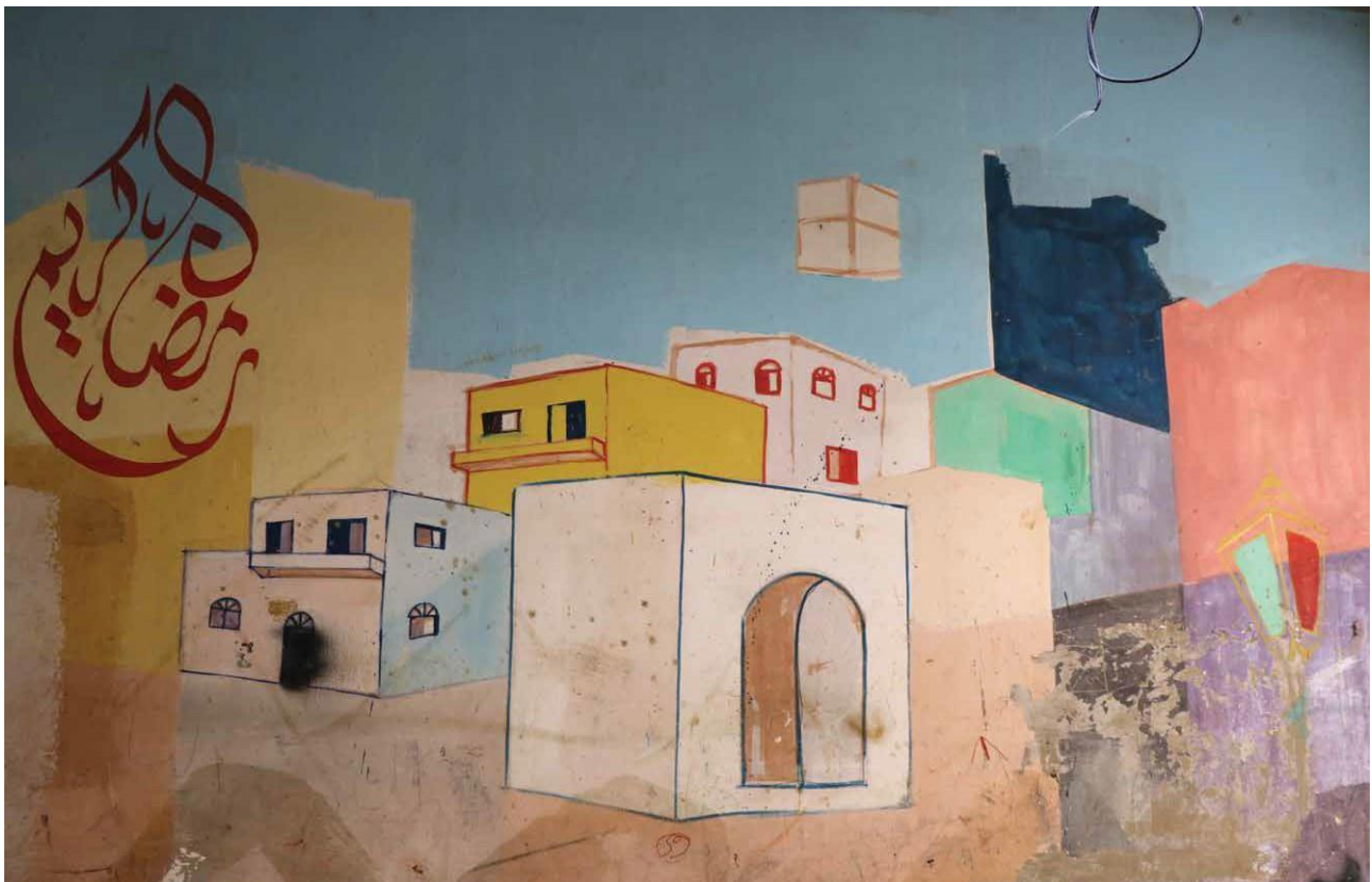
A mural in Baddawi camp wishing passersby a Ramadan Kareem

The report concludes with a synthesis of the key implications of this study for research. This lays the foundations for a 2020 Policy Briefing which will draw out the policy relevance of the research.