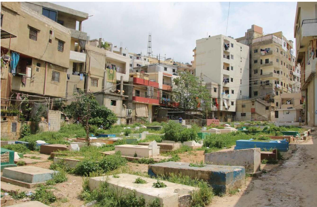
The original cemetery in Baddawi refugee camp, Lebanon

As such, this report examines the significance of religion and politics in relation to social justice for refugees and the racialization and politicization of refugees and refugee response.