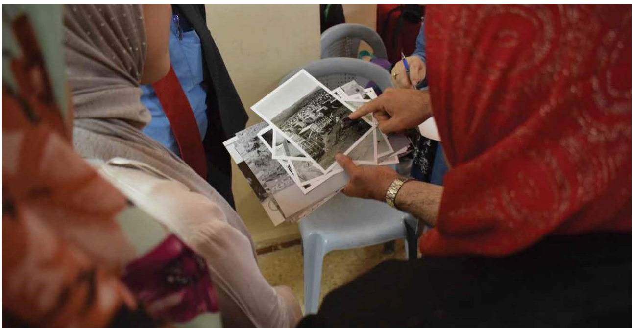
Participants attending a Refugee Hosts writing workshop, Jordan

on their nationality. On the one hand, Palestinians from Syria only receive limited assistance from UNRWA and can only access UNRWA-run educational and health services which are increasingly under-funded and under strain. 62 On the other hand, non-Palestinian refugees from Syria (including Syrians, Iraqis, Kurds) are registered with UNHCR and are entitled to a wider range of services and programmes. Most importantly for many residents in the camp, non-Palestinian refugees from Syria have the possibility of being referred by UNHCR to be resettled to a third country. Palestinian refugee families who have resided in the camp since the 1950s remain stuck in the camp, observing the different forms of assistance and possible resettlement options that are being provided to new arrivals. 63