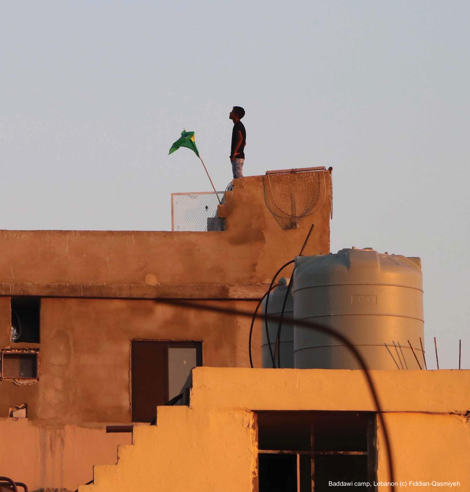
Baddawi camp, Lebanon